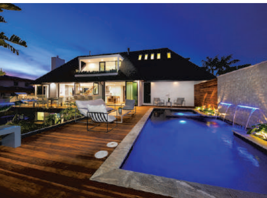
4BD/5BA | 7732 Lookout Dr. | La Jolla $4,450,000 | 858.361.0303