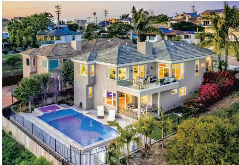
4BD/3½BA | 5175 Solar St. | Bay Park $1,699,000 | 858.333.1492