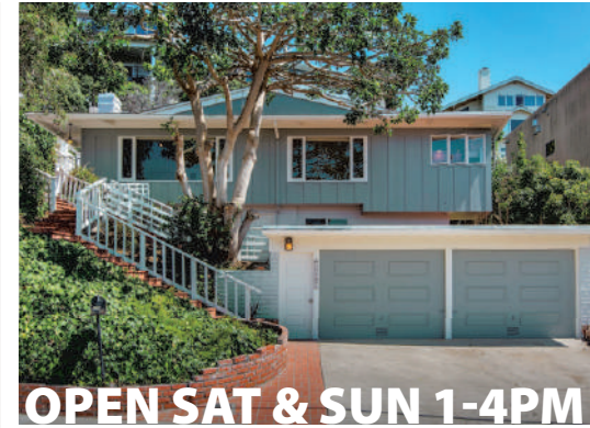
3BD/3BA | 6767 Neptune Place, 104 | La Jolla $3,298,000 | 858.551.6630