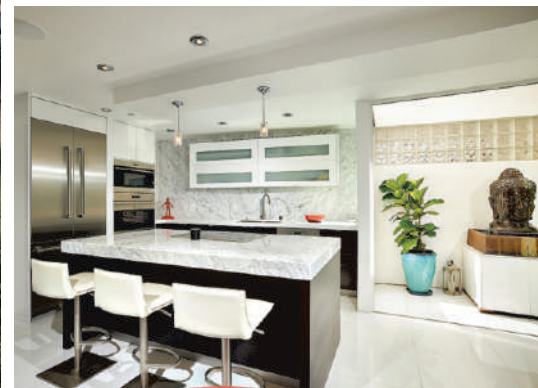
3BD/2½BA | 101 Coast #3A | La Jolla $2,450,000 | 858.926.8779