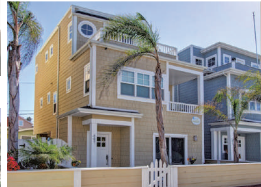
3BD/3BA | 807 San Rafael Pl | Mission Bay $1,645,000 | 858.859.3370