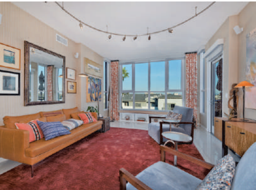
2BD/2BA | 845 Fort Stockton #514 | Mission Hills $899,000-$919,000 | 619.920.2307