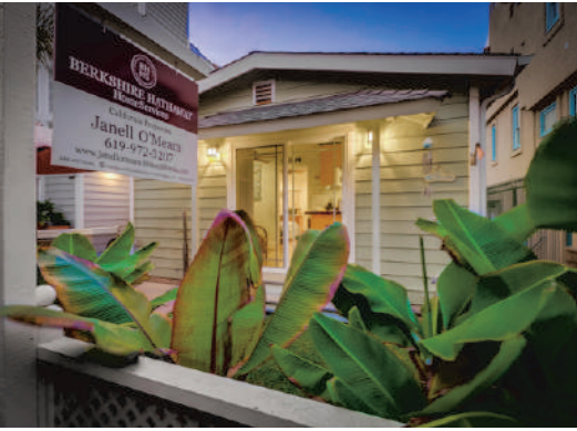
2BD/2BA | 810 Vanitie Cour | Pacific Beach $1,148,000 | 619.972.3207